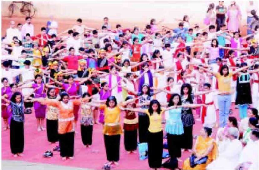
Children practising breathing exercises