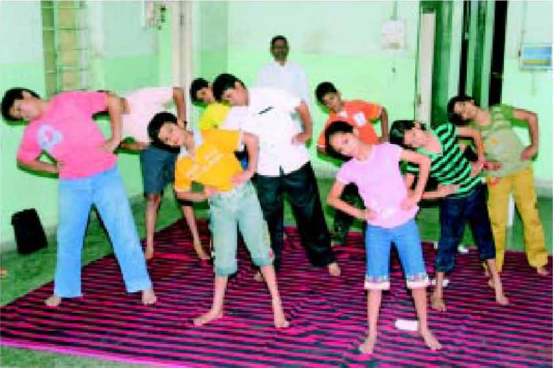
Children practising breathing exercises