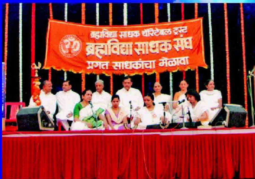
Advance Course gathering at Thane