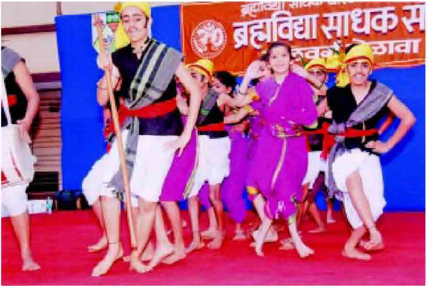
Children presenting a folk dance at an annual gathering