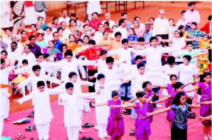
Children practising breathing exercises at annual gathering held at Vile Parle