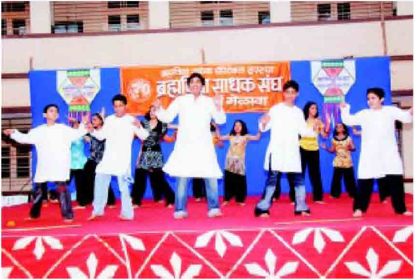
Children presenting a cultural programme at an annual gathering