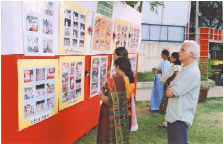
Brahma Vidya picture gallery